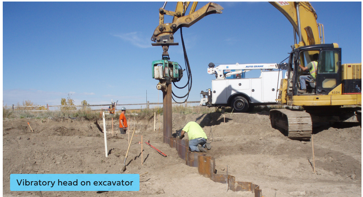
Vibratory head on excavator