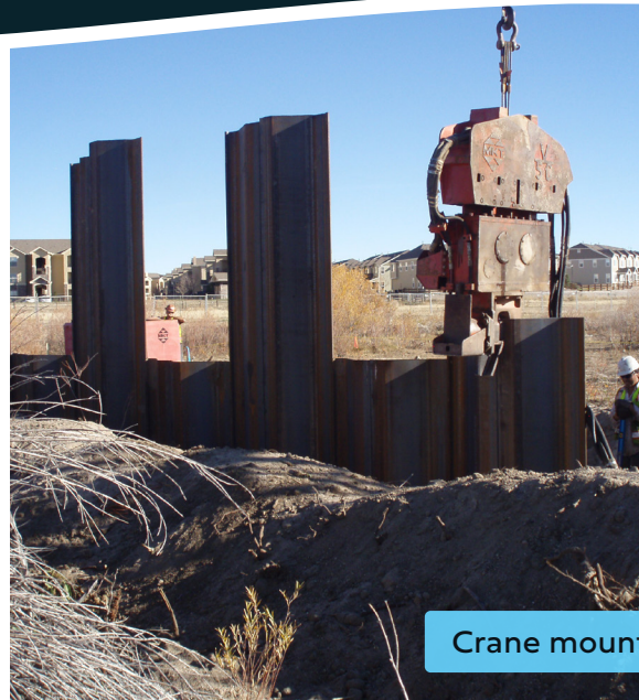
Crane mounted driver head